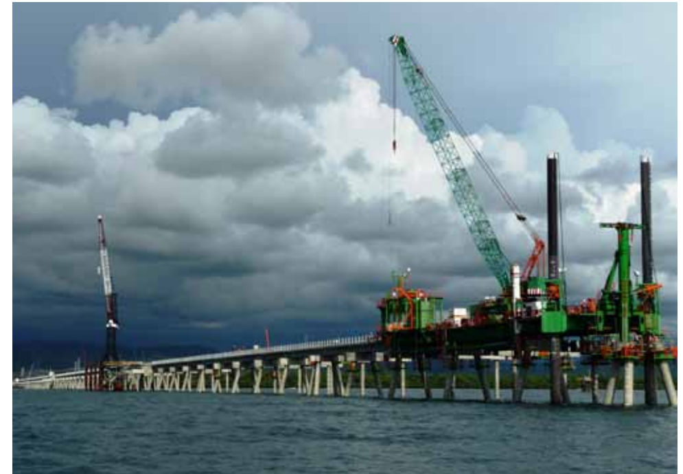
LNG jetty currently being constructed by BAM International