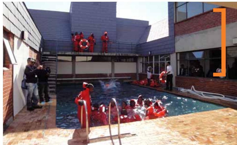
STC Training Academy in Cape Town, South Africa

Secondly, an Engineering Faculty at Groenberg Secondary School was established. STC-Group supplies computers, know-how and equipment. Annually, 20 bursaries for tertiary studies are provided.